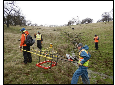
Right: Portable (hand carry) advanced metal detector

During the field investigation, workers walk or drive across the sites along designated paths with specialized metal detectors designed to determine the density and distribution of underground metal objects (anomalies) that may be military munitions. Density refers to the number of anomalies. Distribution refers to the three-dimensional location of the anomalies. The equipment and techniques used to develop that complete picture include Digital Geophysical Mapping along with Advanced Geophysical Classification. Buried items of interest will be intrusively investigated (dug up) to classify the types of anomalies that are present. Soil samples may also be taken to determine if explosives and metals associated with military munitions may exist in the soils.