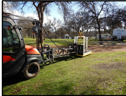
Left: Advanced metal detector equipment being pulled over flat terrain.

The remedial investigation will include biological and cultural surveys. The biological survey will identify what protected species are present and the cultural survey will identify if there are historic or prehistoric archaeological sites, so that biological and cultural resources are protected as mandated by law.